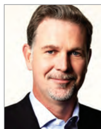
Reed Hastings Co-Founder and CEO, Netflix